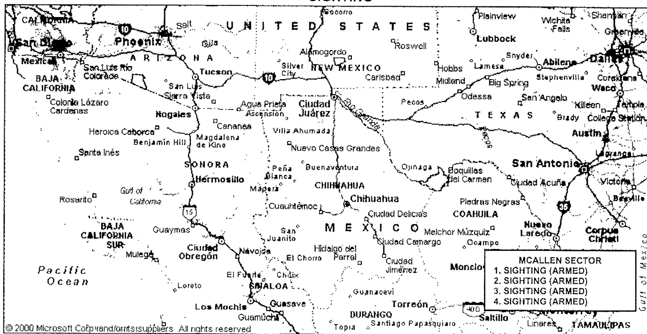
Chronological Listing and Map of Sightings for FY 2004