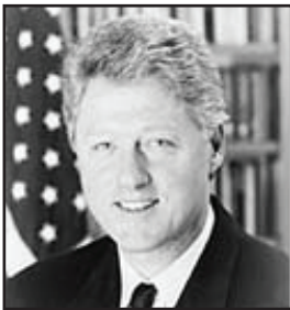
Former President Bill Clinton

Hillary toured the country denouncing a controversial deal that would have allowed an Arab government-owned company, Dubai International, to run the operations of certain American ports while a firm operated by her top advisers quietly lobbied for the same Arab company's takeover of two U.S. defense plants. The New York senator claimed national security concerns led her to vehemently oppose the port deal yet refused to explain why her own top advisers were secretly helping Dubai International acquire a U.S. firm that makes tanks and aircraft turbines. Incidentally, Dubai paid Hillary's advisers a hefty $100,000 to help it get the defense plants. (Dubai has also given a lot of money to Bill Clinton as well.)