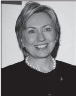
Senator Hillary Clinton

The controversial college thesis that exposes Hillary's Marxist and Socialist views was, until recently, sealed at the request of the Clinton White House to hide the information from the American public. The 92-page document reportedly paints a favorable picture of the radical leftwing community organizer Saul Alinsky, whom Hillary describes as a "compelling personality" with "exceptional charm." The Clintons used their notorious strong-arm tactics to force administrators at Wellesley, a women's liberal arts college in Boston, to create a special rule that made any thesis written by a President or First Lady of the United States off limits. We've seen Hillary take extreme measures to silence her foes. But who could have imagined Hillary could go to such extraordinary lengths to, in effect, silence herself?