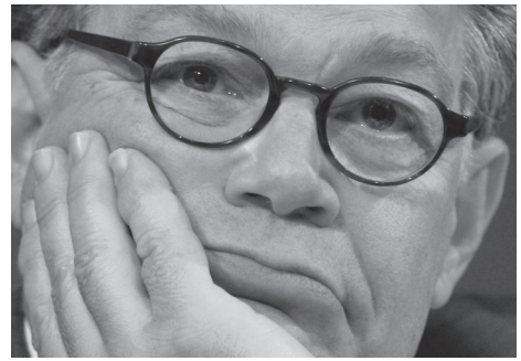
U.S. Senator Al Franken (D-MN)