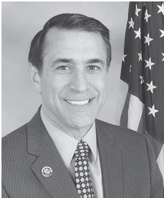
Rep. Darrell Issa (R-CA), Chairman of the House Committee on Government Oversight and Reform