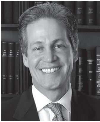
Former U.S. Senator Norm Coleman (R-MN)

The bottom line is that voter registration fraud and voter fraud in Minnesota could well have victimized former Senator Norman Coleman, who lost to Al Franken by 312 votes out of the more than 3 million votes cast.