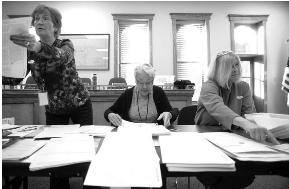
Election officials checking in voters and handing out ballots