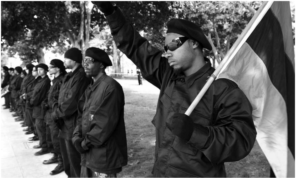
Members of New Black Panther Party