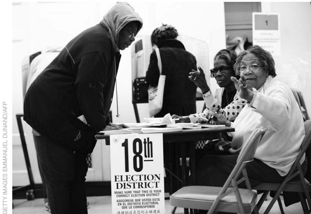
Poll workers assisting a voter

The bottom line, of course, is that all Americans who are legally eligible to vote, regardless of their political beliefs, should be able to vote...and that vote should be counted. The perception of fraud keeps people who should vote away from the polls; and the existence of fraud can neutralize legitimate votes and even change the outcome of elections.