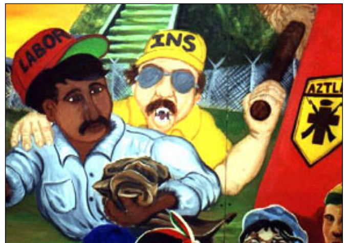
Cal State North Ridge Chicano studies mural.

MCINTYRE: Certainly, and please know our welcome mat is always out for Judicial Watch.