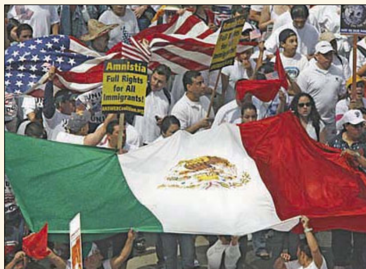
Photo: Protesters in San Francisco wave Mexican flags.