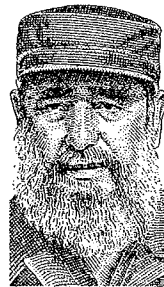
Fidel Castro Supports FALN