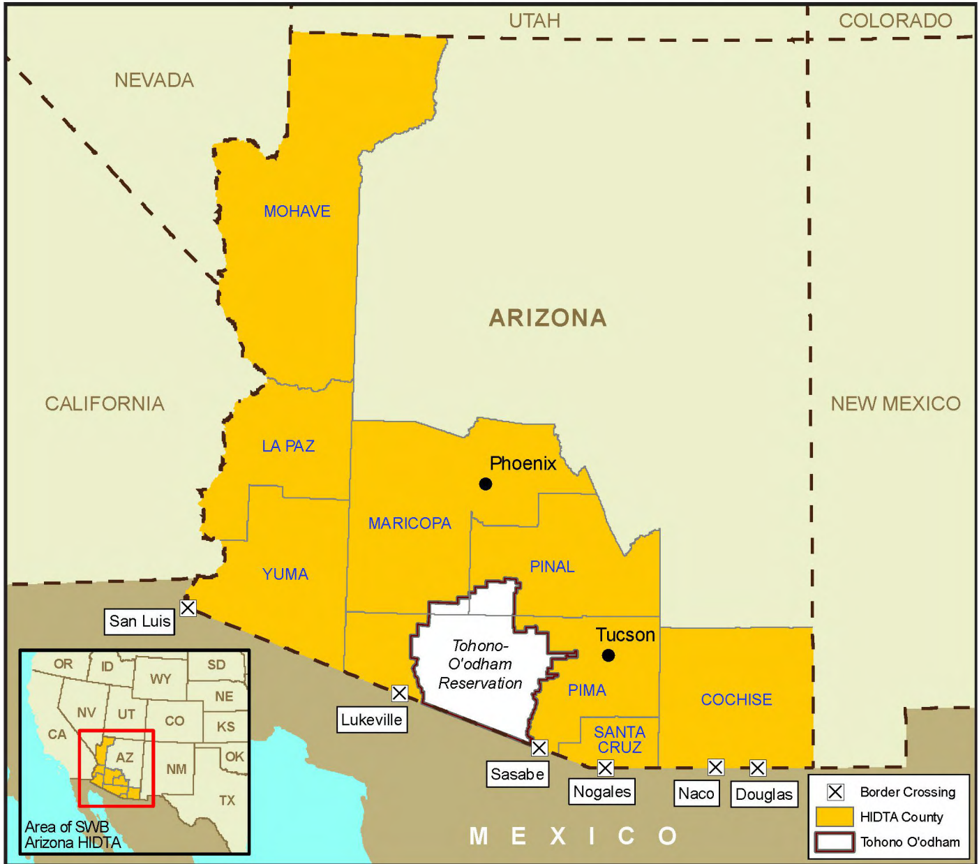
Figure 1. Arizona High Intensity Drug Trafficking Area