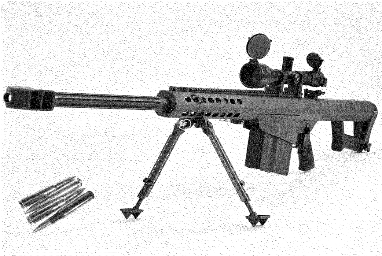
Barrett .50 Caliber Rifle

Law Enforcement Agents Warn Congress They Lack Adequate Tools to Counter Illegal Firearms Trafficking