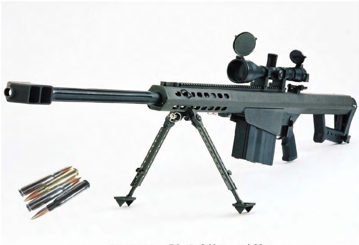
Barrett .50 Caliber Rifle

Law Enforcement Agents Warn Congress They Lack Adequate Tools to Counter Illegal Firearms Trafficking