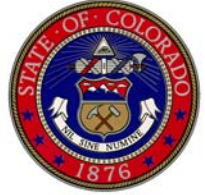
John W. Hickenlooper Governor

136 State Capitol Building Denver, Colorado 80203 (303) 866 - 2471 (303) 866 - 2003 Fax