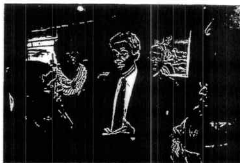
In this photo taken Monday, April 11, 2011, then-U.S. envoy Chris Stevens speaks to local media before attending meetings at the Tibesti Hotel where an African Union delegation was meeting with opposition leaders in Benghazi, Libya. Read more.