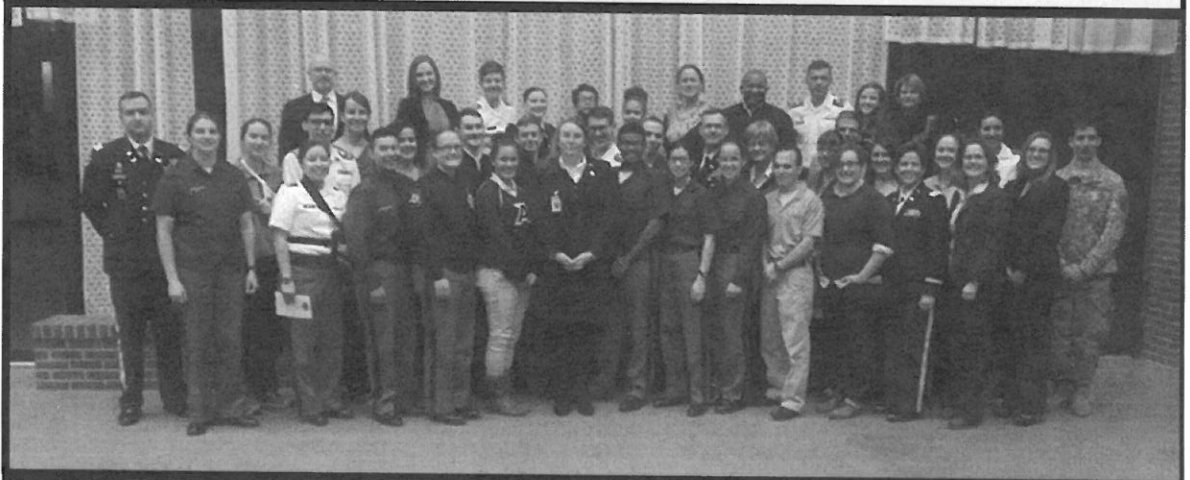
Above Image: Attendees of the evening Transgender Day of Remembrance Ceremony