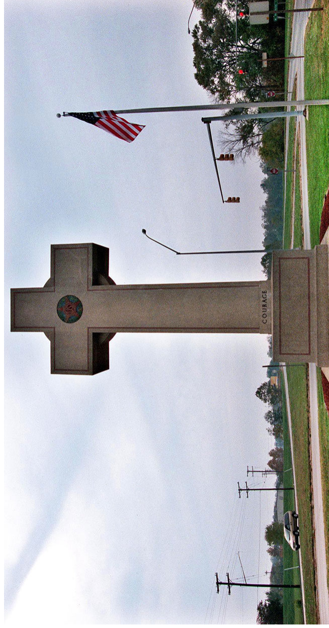
THE BACK VIEW DISPLAYING “COURAGE”

www.dailysignal.com/2018/03/26/obama-judges-rule-cross-monument-must-go-showing-elections-consequences/