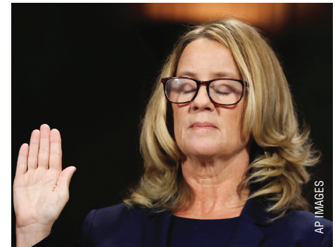
Christine Blasey Ford sworn in at the Senate Judiciary Committee confirmation hearing for Supreme Court nominee Judge Brett Kavanaugh, September 2018

During Kavanaugh's confirmation hearing in early September, it became clear that leftists were prepared to go to extreme measures trying to blow up the Senate confirmation process and destroy a man with whom they disagree. Leftist law-