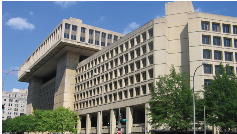
FBI Headquarters, Washington, D.C.

The FBI report on Supreme Court nominee Brett Kavanaugh confirms what most in Washington knew all