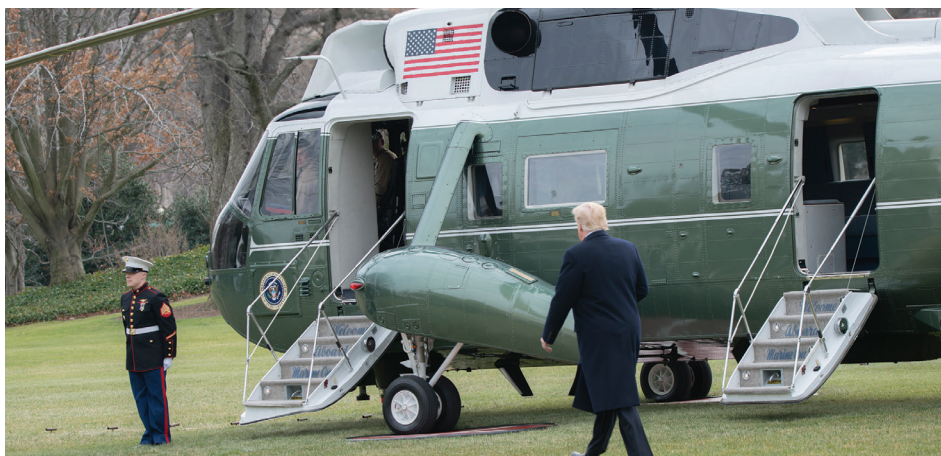
President Donald Trump leaves the White House to go to his winter home in Mar-a-Lago, Florida