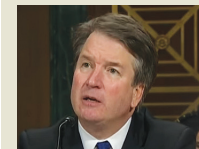
Supreme Court Justice Brett Kavanaugh