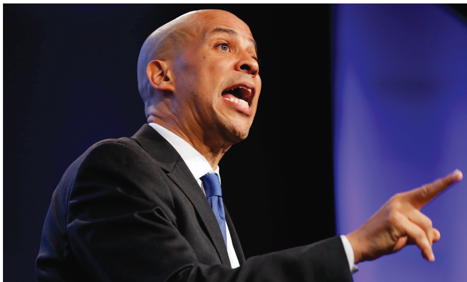
Senator Cory Booker