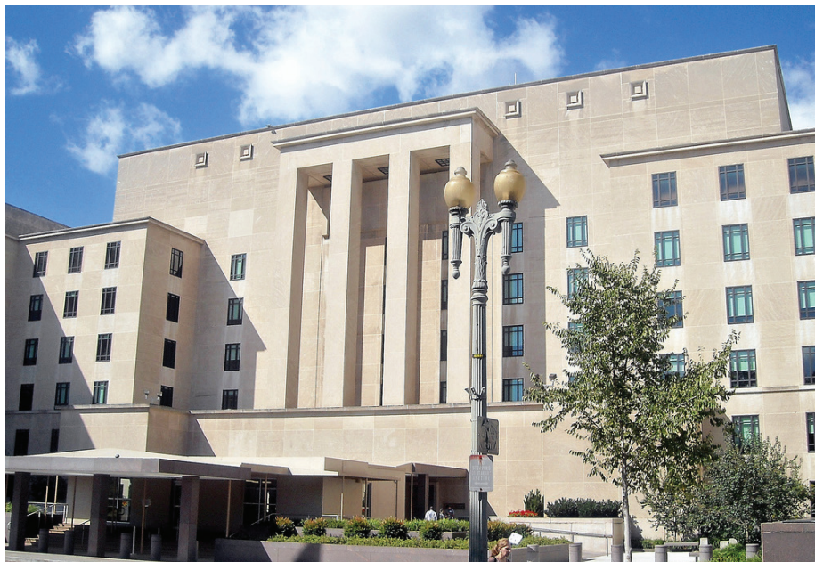
U.S. Department of State

In addition to Albania, Judicial Watch also has filed FOIA lawsuits against the State Department and USAID for records about funding and political activities of George Soros’ Open Society Foundations in Macedonia, Romania and Colombia.