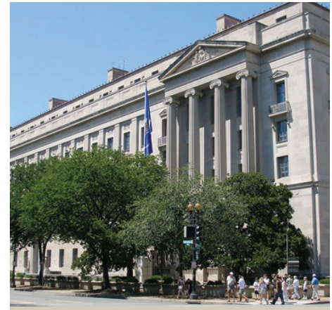
U.S. Department of Justice, Washington, D.C.