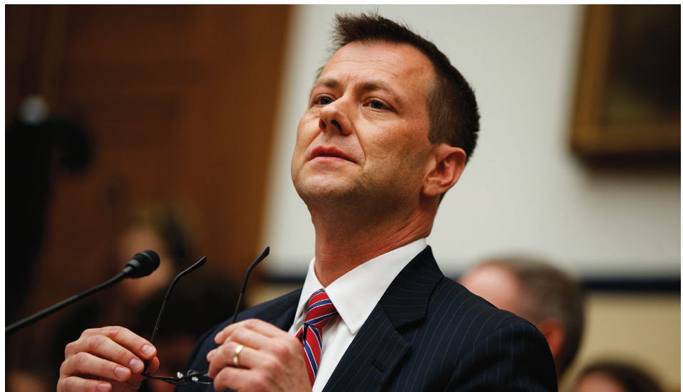
Former top FBI agent Peter Strzok

The newly obtained emails came in response to a May 21 order by U.S. District Judge Reggie B. Walton to the FBI to begin processing 13,000 pages of records exchanged exclusively between Strzok and Page between Feb-