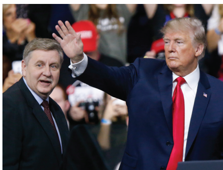
President Donald Trump, right, acknowledges the crowd during a campaign rally with Republican Rick Saccone, March, 2018

tober 1. The Secret Service spent $171,391.68 on hotels, $8,611.30 on air/rail, $2,482.17 on car rentals, and $16,407.50 on miscellaneous, for a total of $198,892.65.